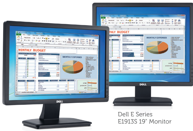
Dell E Series E1913S 19" Monitor