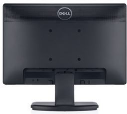
Back view (E1913)