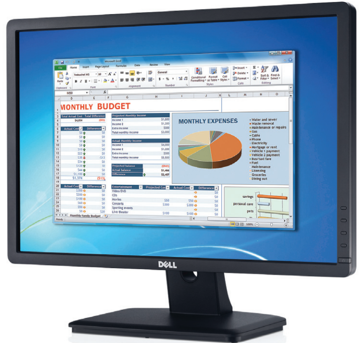
Dell E Series E2213 22" Monitor