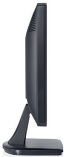
Side view (E1913)