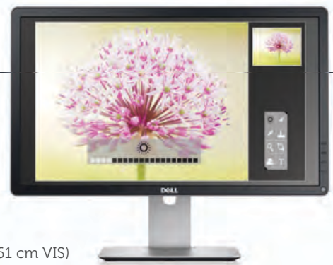
Dell 22 Monitor | P2214H (21.5", 54.61 cm VIS)