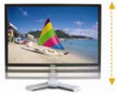
1) Height Adjustment