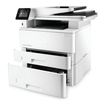
HP LaserJet Pro MFP M426fdw with optional 550-sheet paper trav